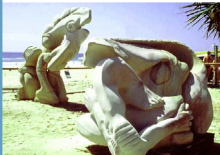
“The Elements” at Main Beach, Surfers Paradise, Gold Coast.

Created individually for your space, or choose smaller pieces from limited editions.